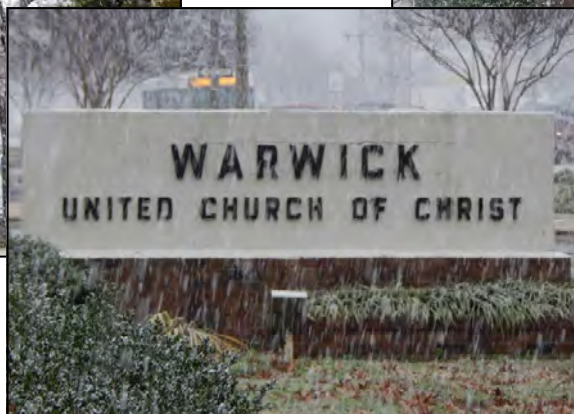
Church Grounds