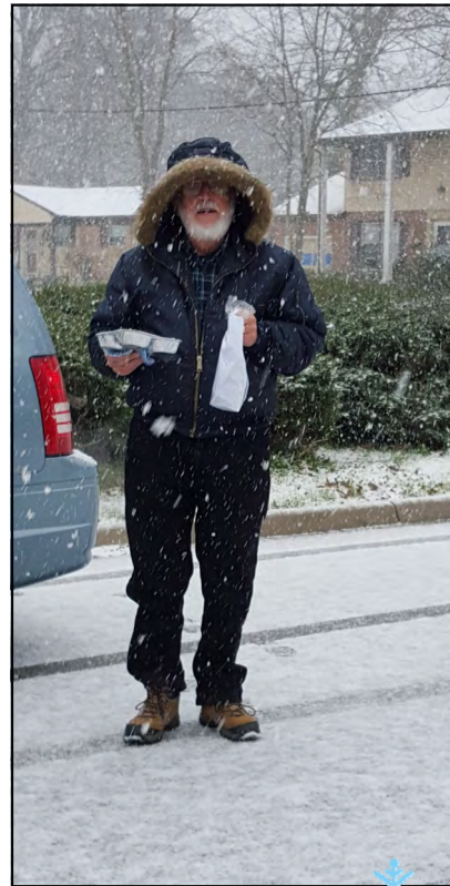
Meals on Wheels